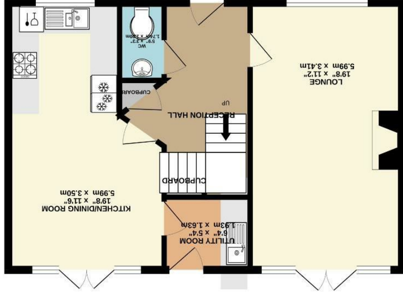
GROUND FLOOR 562 sq.ft. (52.2 sq.m.) approx.

TOTAL FLOOR AREA : 1129 sq.ft. (104.9 sq.m.) approx.